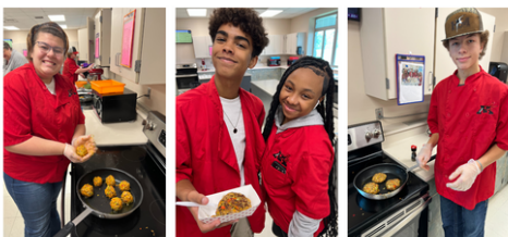
FAMILY & CONSUMER SCIENCE DEPT INDIGENOUS PEOPLES' DAY CULINARY LAB

Education and Art: Take time to educate yourself and your children about the history, contributions, and cultures of Native American communities. The Native American Heritage Month website has a lot of great resources. The Monticello High School's Family & Consumer Science Department did a Culinary Lab in October that highlighted Indigenous Peoples Day with our Culinary I, 2 & 3 classes. Over 200 students cooked a wild rice cake recipe that was inspired by the Minneapolis Sioux Chef's Indigenous Kitchen Cookbook.